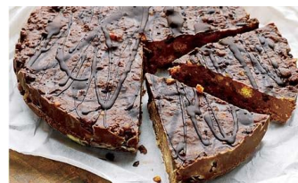
Fairtrade fridge cake*

There are lots of yummy Fairtrade recipes online, so why not also have a go at making something - perhaps for the Friday Cake Raffle , or a Fairtrade Fortnight Cake Stall... ?